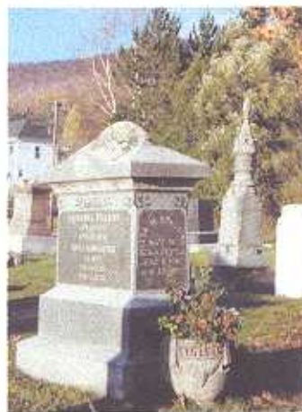
Stalbird Lot, Jefferson Hill