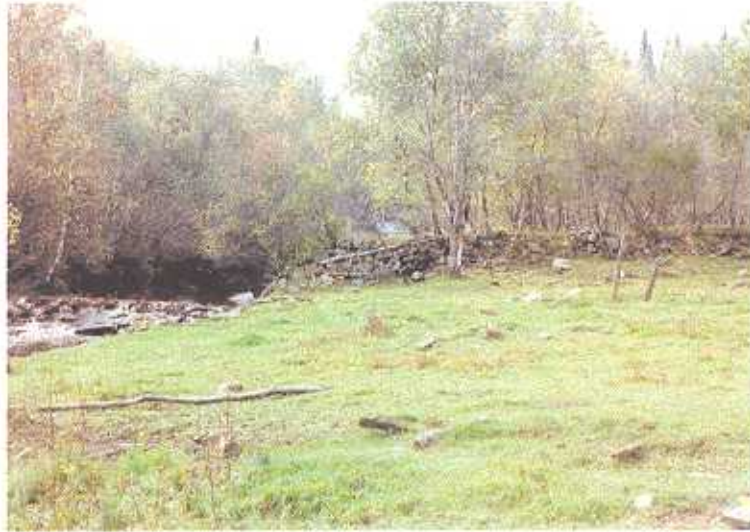
Site of the "Whipple Stand"

Slavery was to involve Whipple in an interesting footnote to history. It is found in a letter in the Library of Congress. In 1796 a slave named Oney Judge, who was the property of Martha Washington, ran away from the President's residence in Philadelphia and found her way to Portsmouth, New Hampshire. When Washington learned of her whereabouts he asked Secretary of the Treasury Oliver Wolcott to arrange for her return. Wolcott sought Whipple's assistance. Whipple interviewed Oney. He wrote to Wolcott that, "After a cautious examination it appeared to me that she had not been decoyed away [by a Frenchman] as had been apprehended, but that a thirst for compleat (sic) freedom which she was informed would take place on her arrival here & (in) Boston had been her only motive for absconding". In the years following Whipple, using the skills learned as a bureaucrat, managed to avoid sending Oney back. She married a sailor named John "Black Jack" Staines, had several children and died in old age in Greenland, New Hampshire, a free woman.