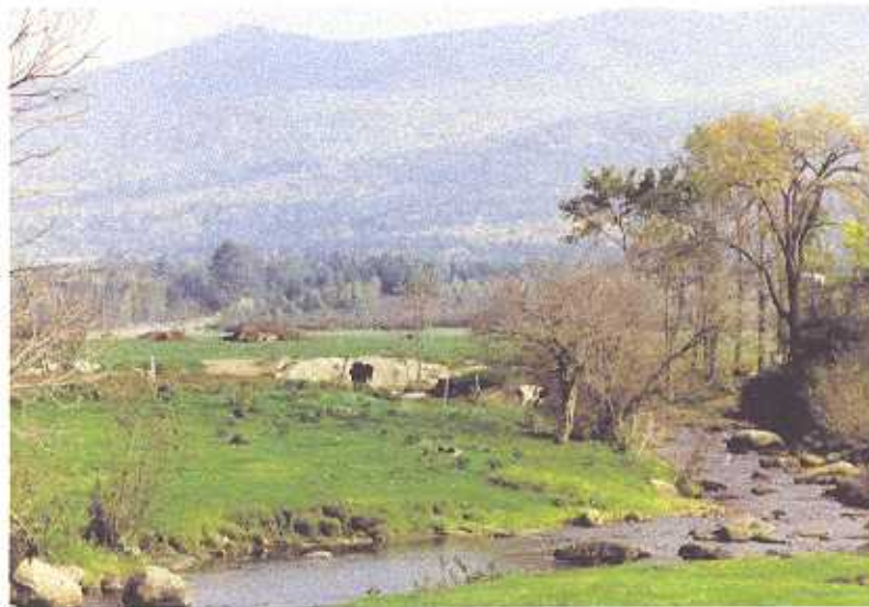
The view from the "Whipple Stand "

Whipple owned a farm which stood near the confluence of Mill Brook and the Israel River where magnificent views of the Presidentials and the Pliny Range spread across Jefferson Meadows. The Lalumieres' E&R Farm is located close to the original site of what was in later years to be called the "Whipple Stand". According to lore, one day a group of Indians, led by a white man, entered Whipple's house uninvited and indicated that they were taking him as a prisoner to Canada. They made the mistake of allowing him to go into another room so that he might dress for travel. Out the window he went and down to the meadow where men were mowing hay. The return of the men to the house carrying fence posts which appeared to be muskets, and shouting war whoops, was all it took to set the Indians in panicked retreat.