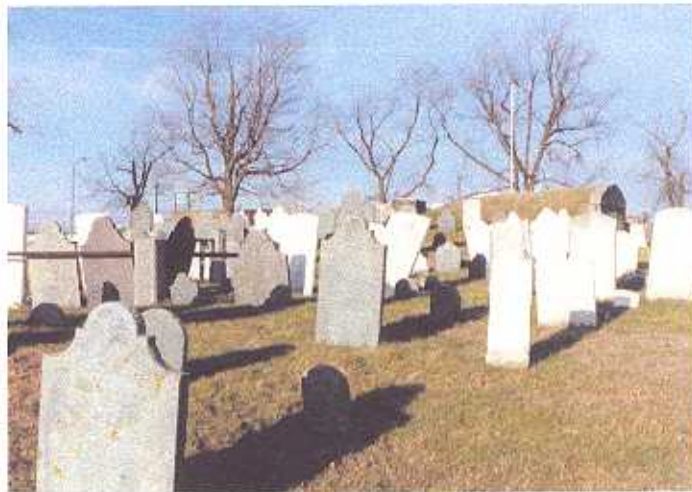
The North Cemetery, Portsmouth