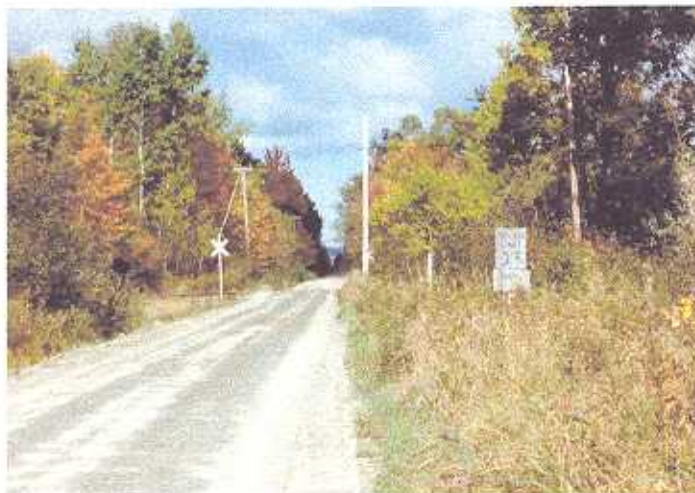
The Turnpike looking east from Route 116