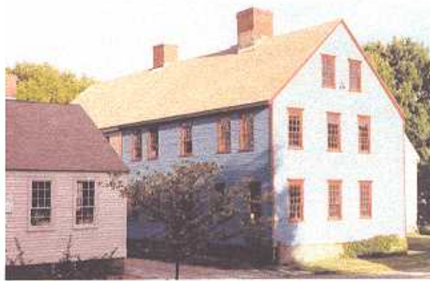
Strawbery Bank Portsmouth

The Colonel's many business ventures were apparently very successful. When he passed away in 1816 at the age of 78 his Will, drawn in 1805, was probated at the Rockingham County Registry of Probate. It references a farm at Kittery, capital stock in bridges, a turnpike and other corporations. It also included a mansion and various other properties in Portsmouth and thousands of acres of land in Jefferson, Bethlehem, Bretton Woods and Colebrook.