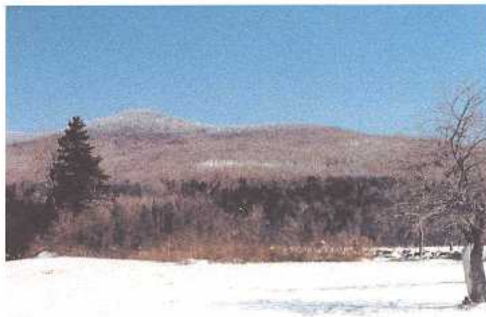
Mount Joseph Whipple from North Road