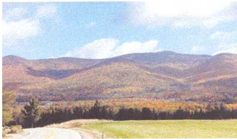
Pliny Range with Mount Joseph Whipple on left

The Colonel's many business ventures were apparently very successful. When he passed away in 1816 at the age of 78 his Will, drawn in 1805, was probated at the Rockingham County Registry of Probate. It references a farm at Kittery, capital stock in bridges, a turnpike and other corporations. It also included a mansion and various other properties in Portsmouth and thousands of acres of land in Jefferson, Bethlehem, Bretton Woods and Colebrook.