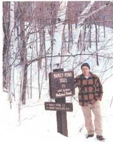
Trail to Mount Nancy, Crawford Notch