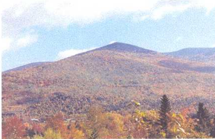
Mount Joseph Whipple from Riverton